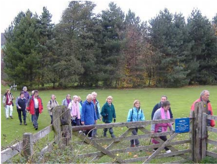
The start of the last mile!

We all followed a waggonway and riverside path back towards Newburn. The river seemed a long way away as the level in this upper tidal section was low, with a local rowing team taking advantage of the calm water.