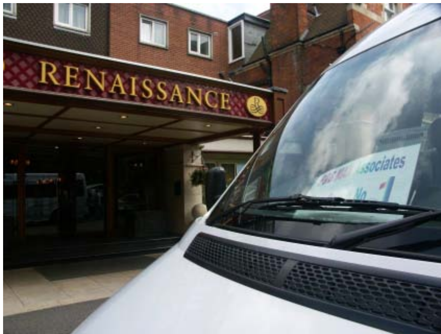
P&G Associates No 1 - says it all!

About 50 Associates took part in a very successful Volunteer Conference at the Renaissance Solihull Hotel on June 14 - 15th 2006. I was glad I had my camera to capture some of atmosphere and enjoyment of the event.