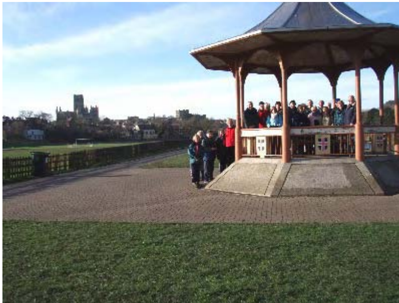
Time for choir practice?

Time for lunch and more conversation. Snow fell later that afternoon.