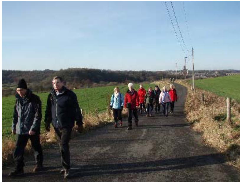
Striding out on the longer route.

After this the parties took different routes but it was always worth a glimpse back to view the Cathedral and Castle backdrop in the winter sun. Overnight frost had hardened the paths slightly, which made for good walking.