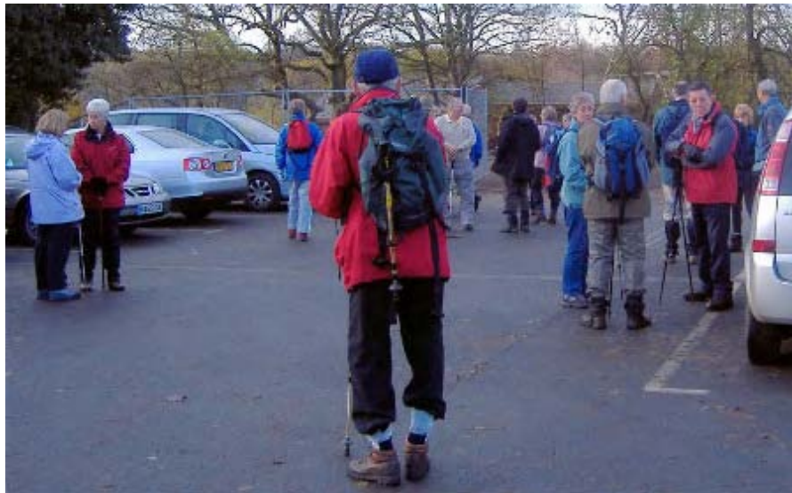
Jack's back - awaiting the muster call!

This was the title given to a circular walk on a good November day, with a choice of distances reflected in the return leg.