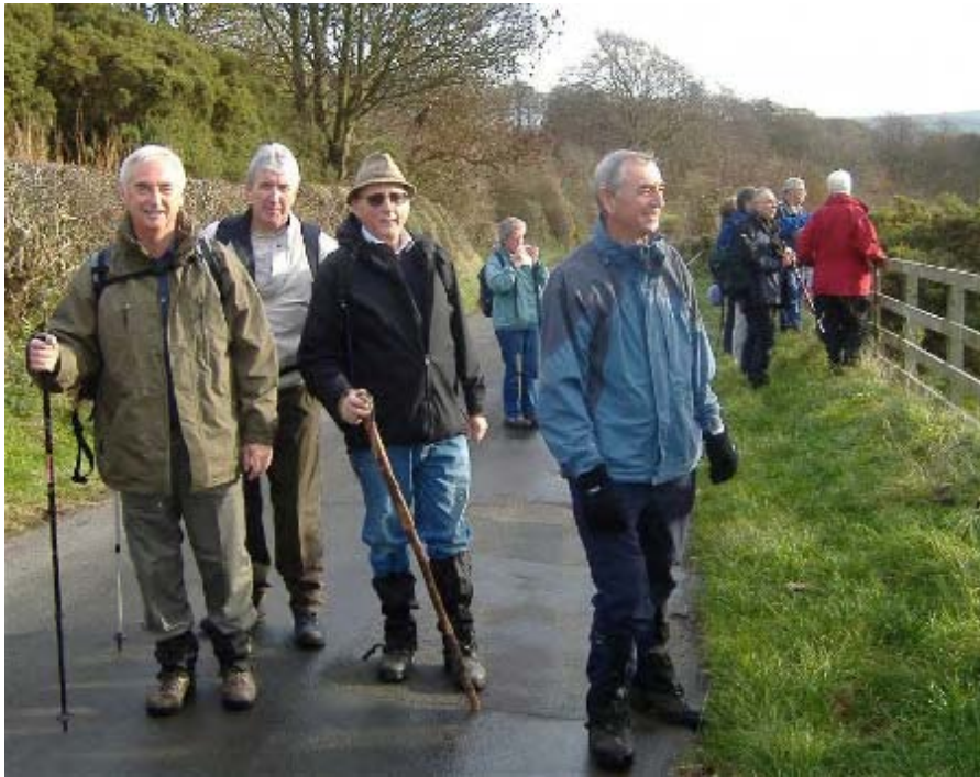
Time for a breather.

From Heddon some walkers took a more direct route back down to the river while others added another couple of miles by heading towards Wylam and joining the riverside track beside the cottage where George Stephenson, he of railways fame, was born.