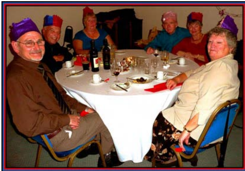
Members of the Church Committee.