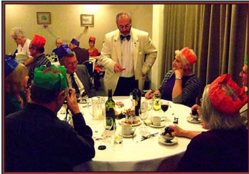
Time for a card trick.