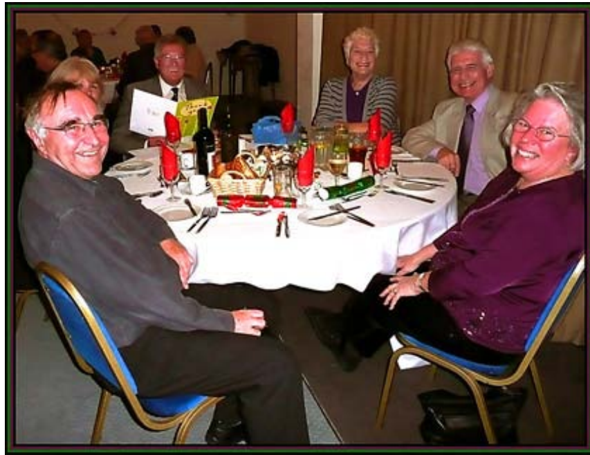
A trio of Tonys