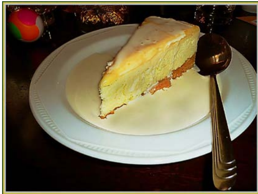
Tempting - and we keep coming back...