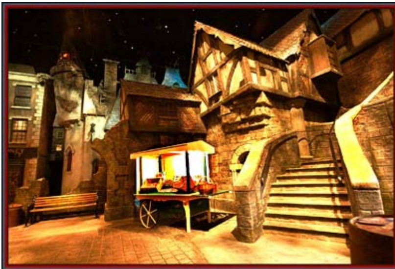
The crime & punishment exhibit.