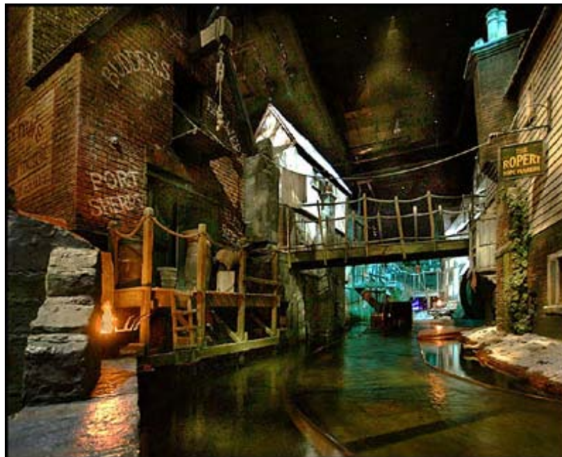
The start of the sewer ride.