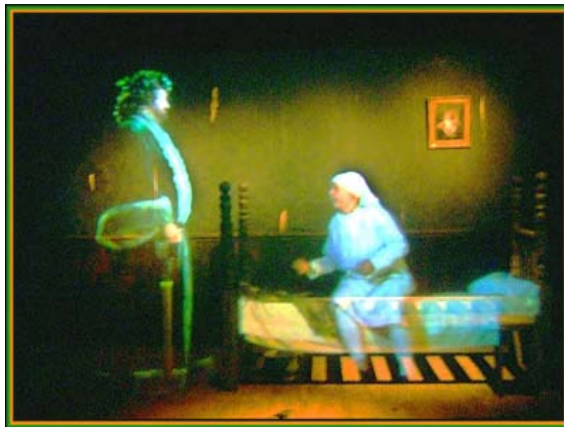
The Christmas Carol - Scrooge, with apparition.

During the day there was a performance by the players of The Christmas Carol, with the apparitions of the ghosts of Christmas past, present and future. The story unfolded and was acted out by members of the staff in appropriate costumes. At the end, when Scrooge was a reformed person, everyone wished each other a Merry Christmas, and there was snow falling from the skies. Very impressive.