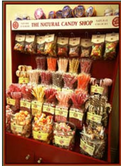
A Victorian Candy Shop.

The tour lasted about three hours, and included a Haunted House, Peggoty's boat house with a 4D high definition show, and the Britannia Theatre with an entertaining animatronics show. It was indeed a day out of a lifetime.