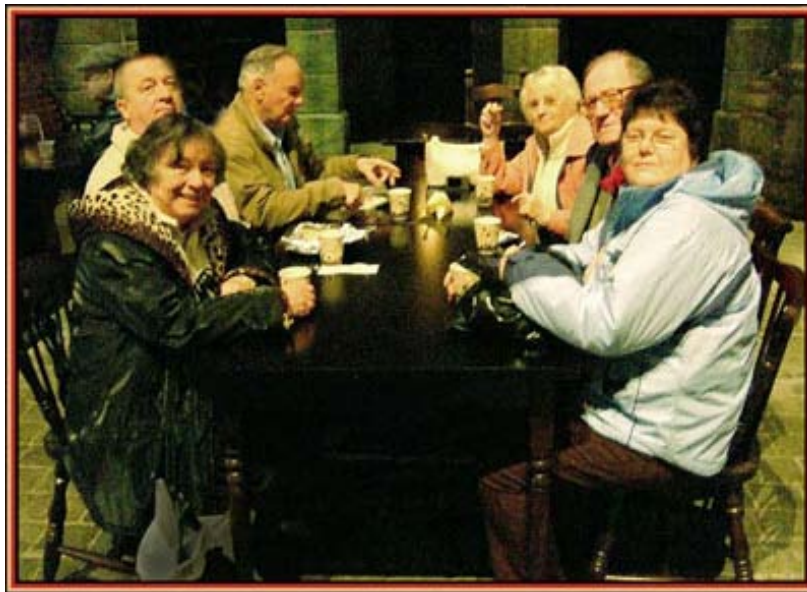
Some took a break in the courtyard before starting the tour.