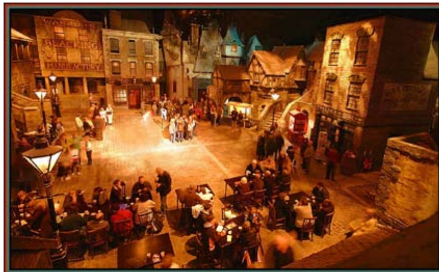
The Courtyard - the start point for the Tour.

The group left Thurrock early in the morning, whilst the fog was still around. We did not really know what to expect, but nevertheless we were all very excited at what lay ahead at the exhibition. It was certainly something very different, and we all had an enjoyable trip. The whole exhibition is under cover, which was a shame because the weather outside was just like a warm and sunny spring day.