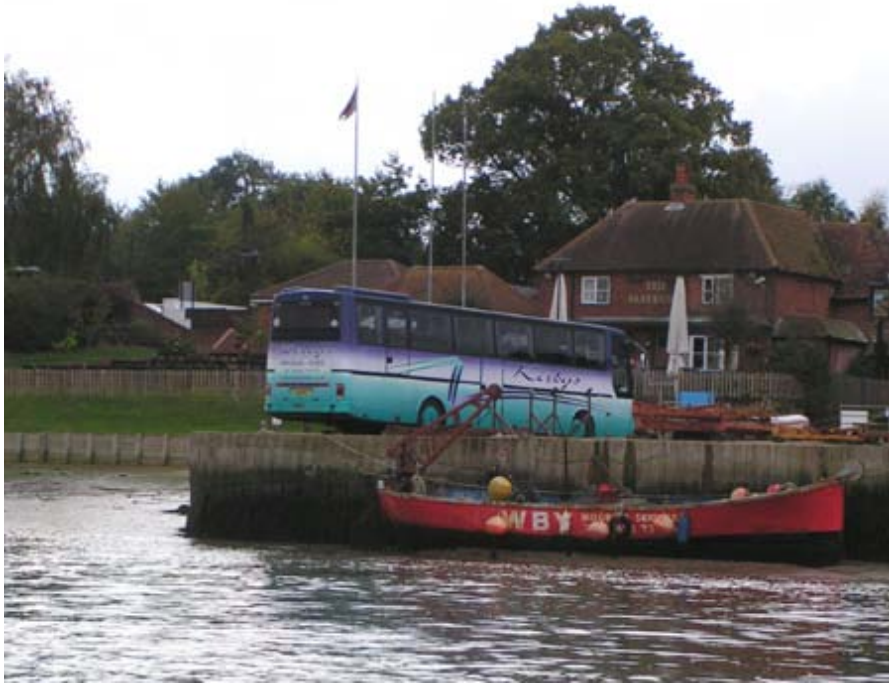
The coach was waiting for us as we returned to the jetty.