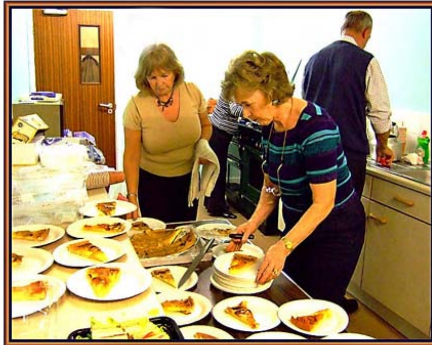
...and prepared the deserts.