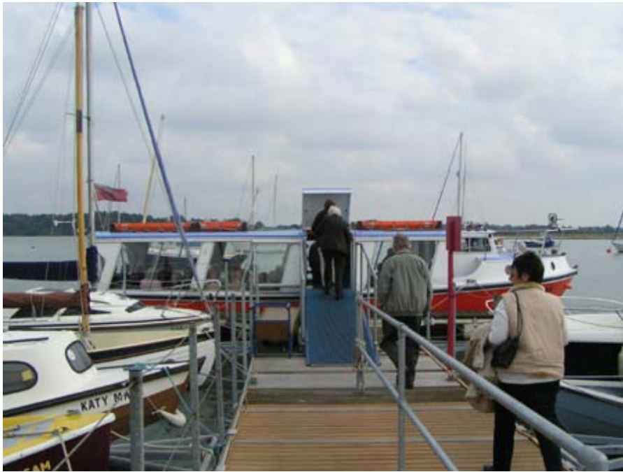
On arrival we were greeted with a glass of sherry.