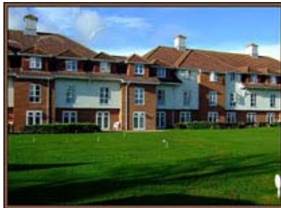
There were no takers for croquet.

However, our spirits were not to be dampened, as the hotel food was plentiful, varied, and of a high standard, and we much enjoyed each others company, also there were plenty of quizzes laid on by the hotel to keep our brains active. Our outings on the Saturday were to the Arreton Farm Craft Centre, (where Jack Sparrow kept an eye on the customers) and where many attractive items were on offer and no doubt, purchased.