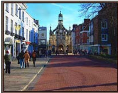
We enjoyed a break in the journey at Chichester which we explored in the winter sun.

'Twas a bright and sunny November morning as 48 jolly Associates and guests wended their way, via Chichester, to Portsmouth to catch the ferry to cross a calm Solent to the delightful Isle of Wight.