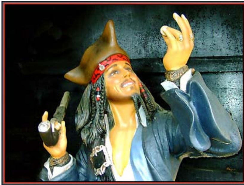
Jack Sparrow, at the Arreton Farm Craft Centre

This was followed by a visit to Newport. However, I have to say the persistent downpours did curb our outdoor activities somewhat.