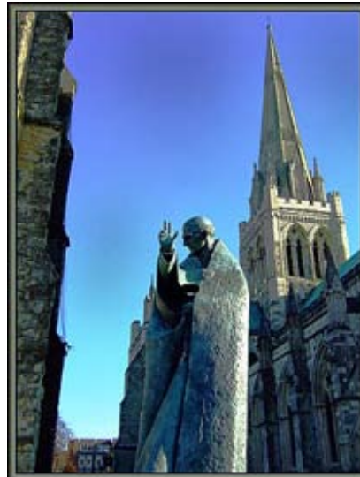
St. Richard, outside Chichester Cathedral.